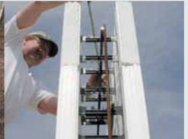
3 Place the rebar