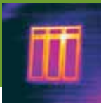
Thermal image of a Logix XtraComfort Home