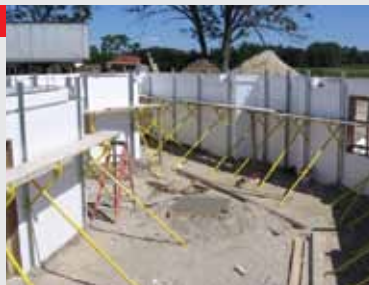
4 Brace the wall