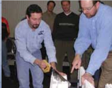
Installer training courses