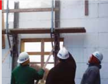
Locally deployed technical support staff

The best ICF builder support program in North America.