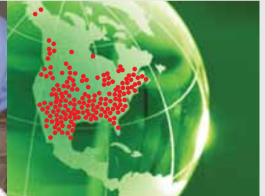
Over 400 local stocking distributors and multiple manufacturing facilities across North America