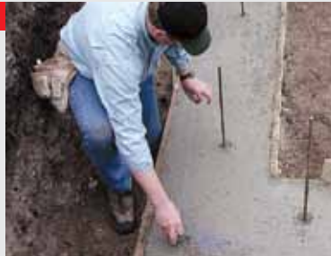
1 Prepare the job site

Thousands of builders have taken Logix training programs and are available to offer you competitive pricing for your project.