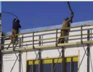
5 Pour the concrete