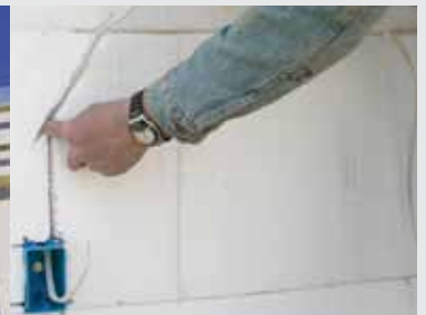
6 Install rough electrical and plumbing