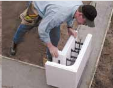
2 Place the first course