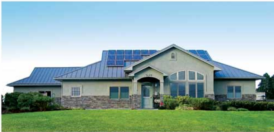
First Universal Design home in the USA – built with Logix ICFs

Green homes are built to last while reducing your home's energy consumption. Logix Insulated Concrete Forms (ICFs) are the ideal choice for both below-grade and above-grade walls because they combine the insulating power of expanded polystyrene and the durability of reinforced concrete. The result – a home that can better withstand nature at its worst, while offering a comfortable home environment at its low-cost best.